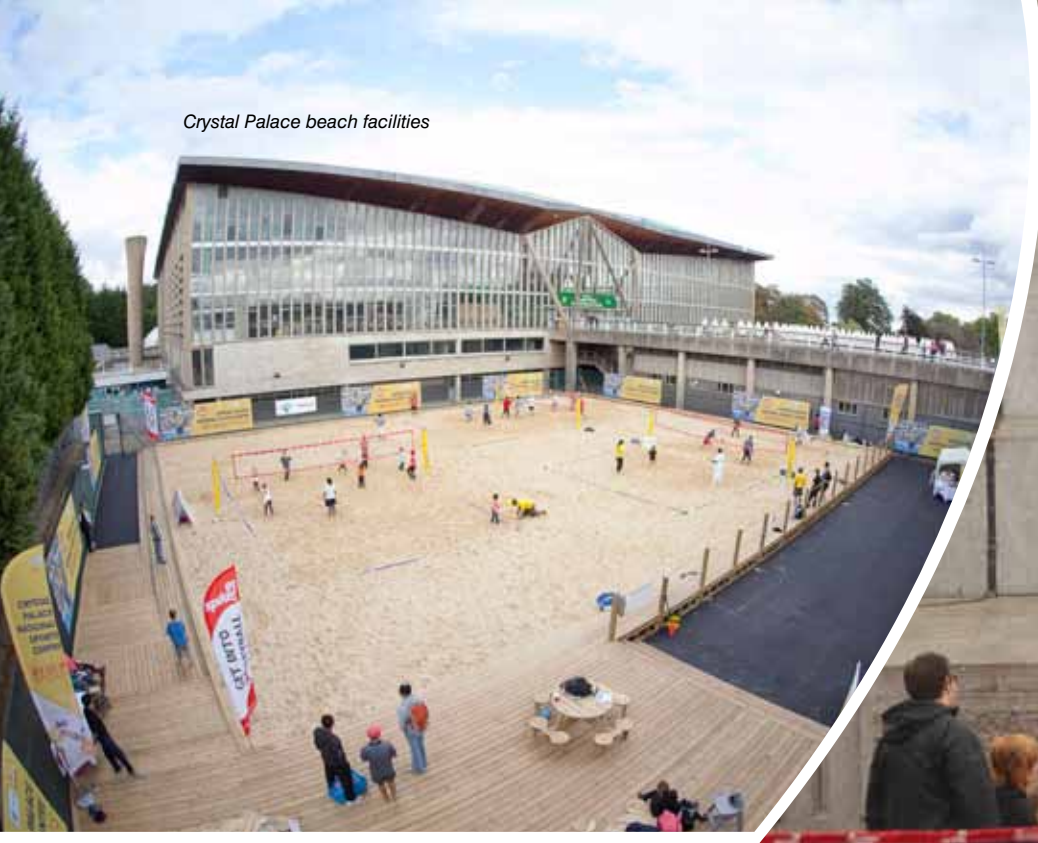
Crystal Palace beach facilities